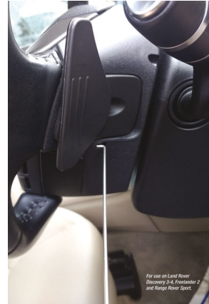
For use on Land Rover Discovery 4-6, Freelander 2 and Range Rover Sport.